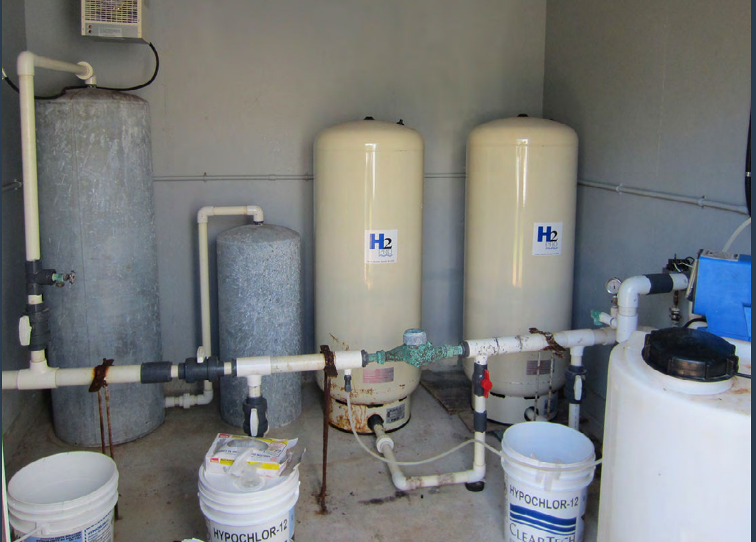
Water treatment plant in Shoal Lake 40.